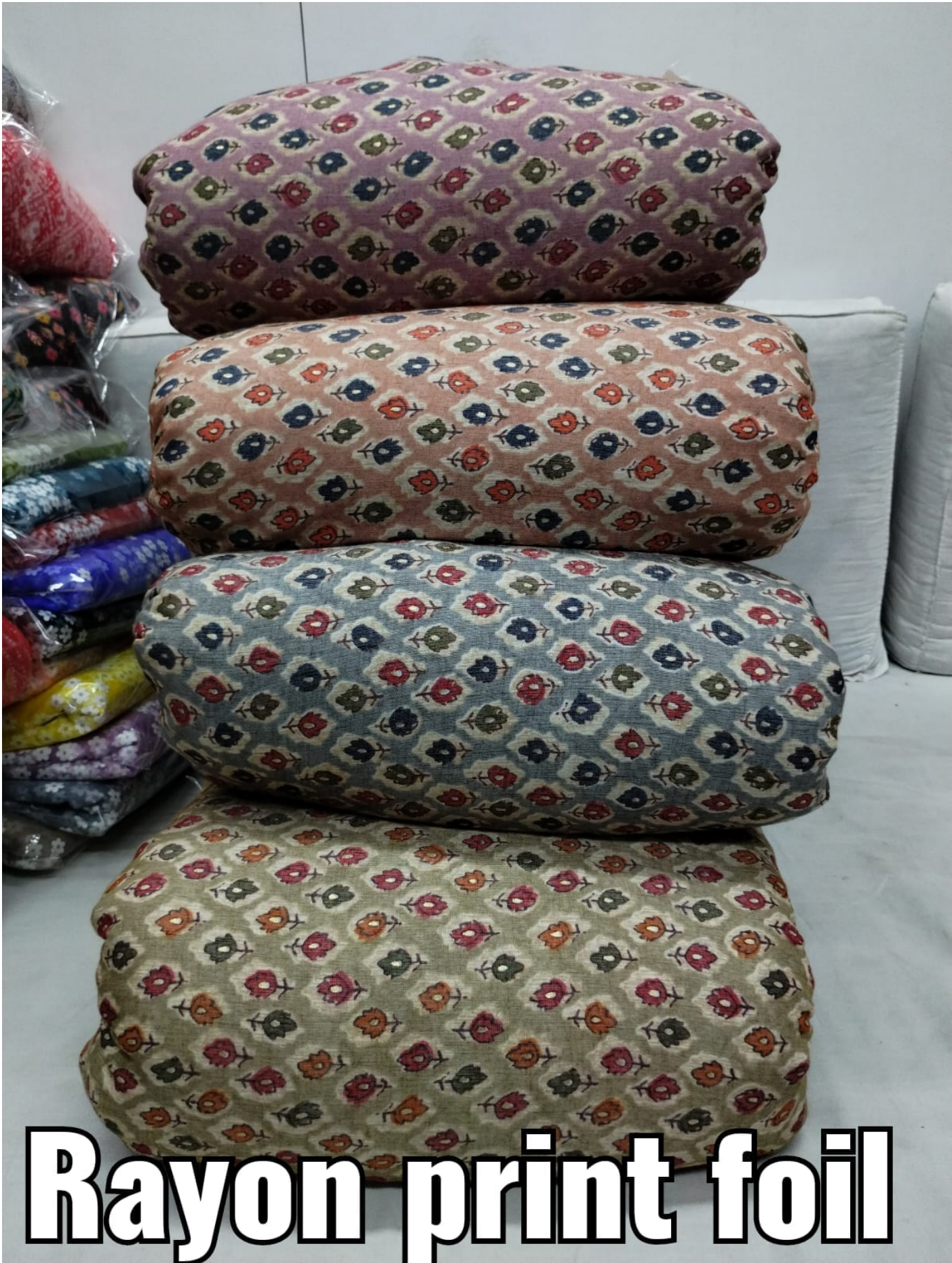
Rayon print foil