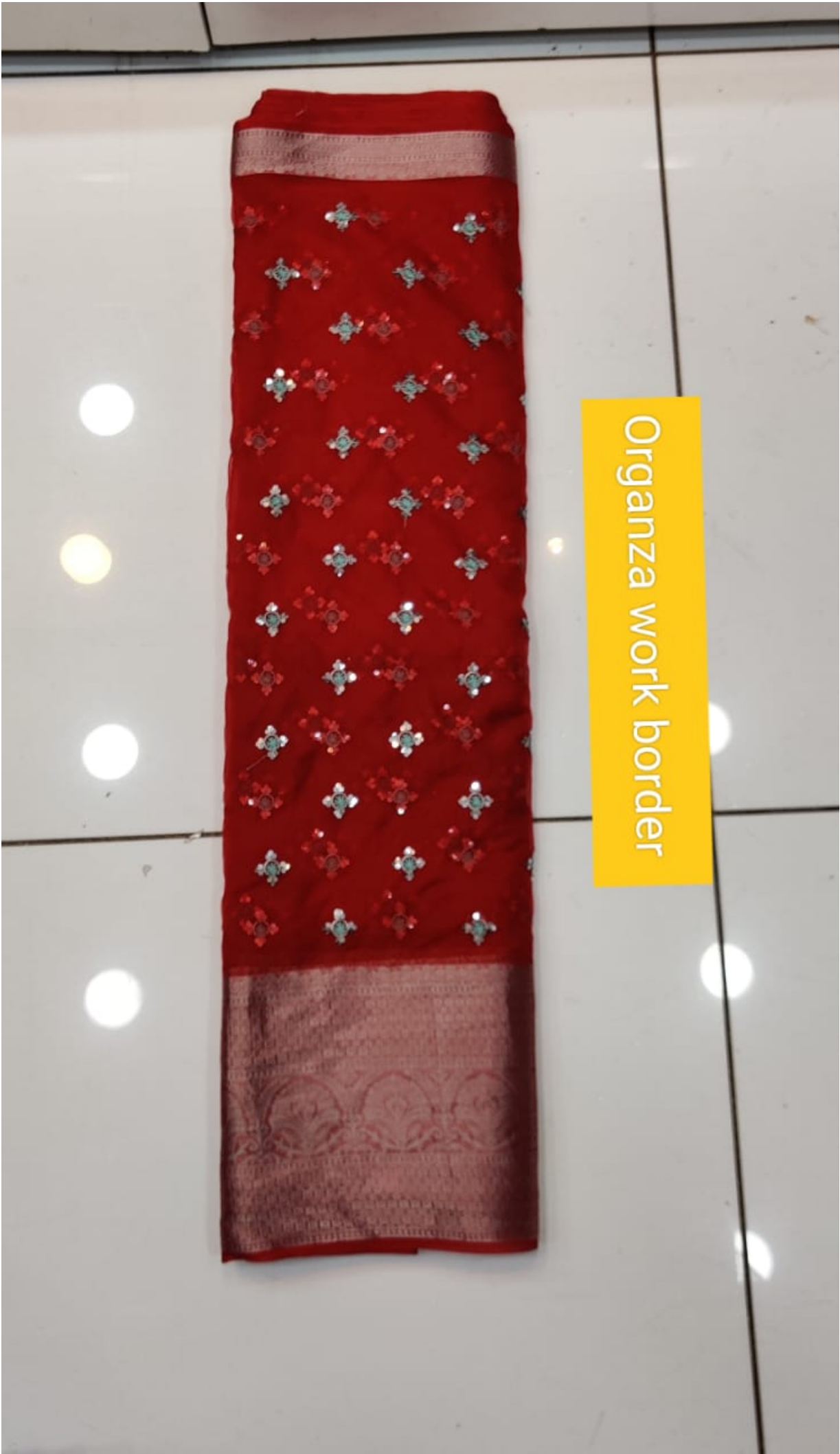
Organza work border