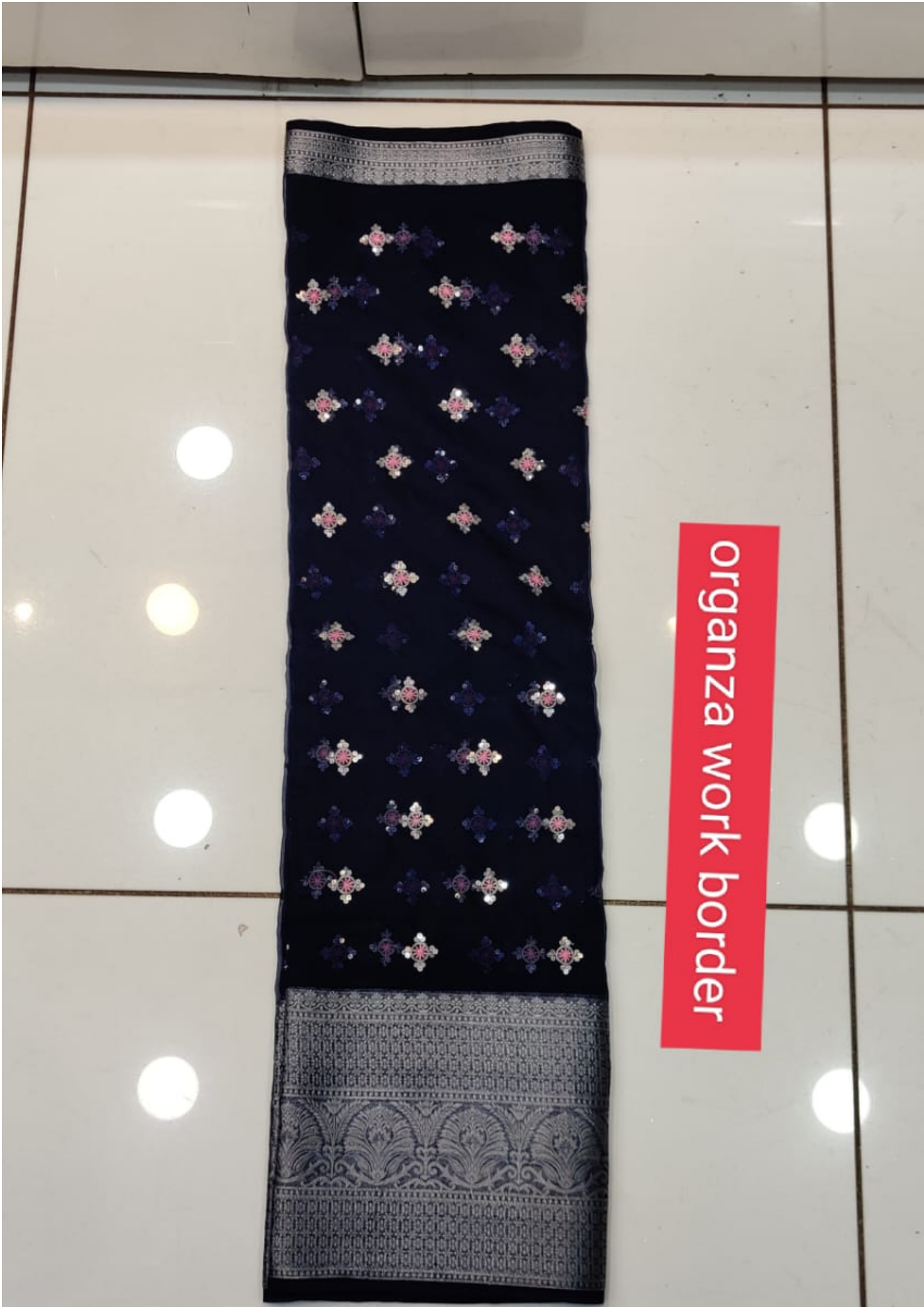
organza work border