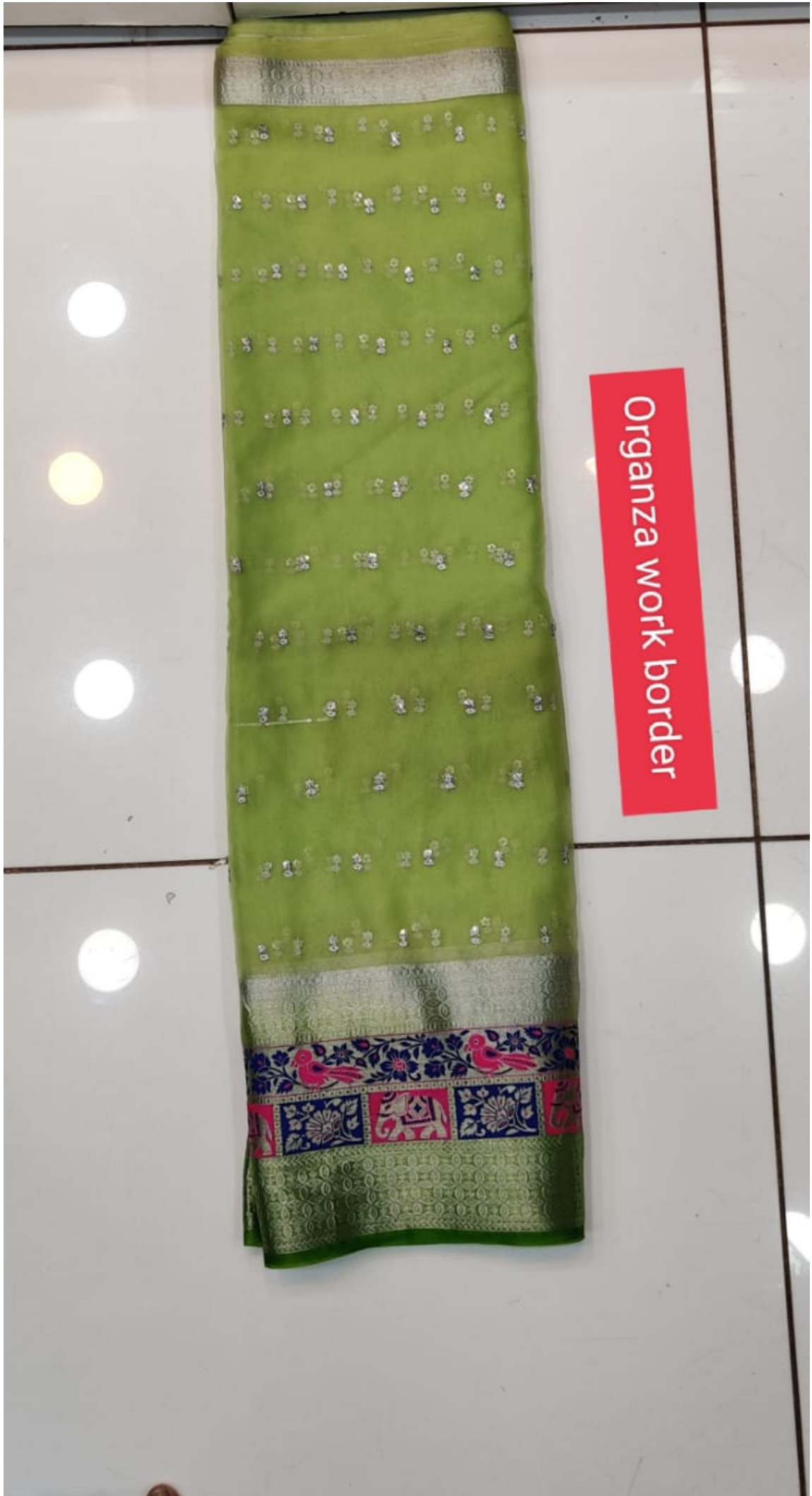
Organza work border