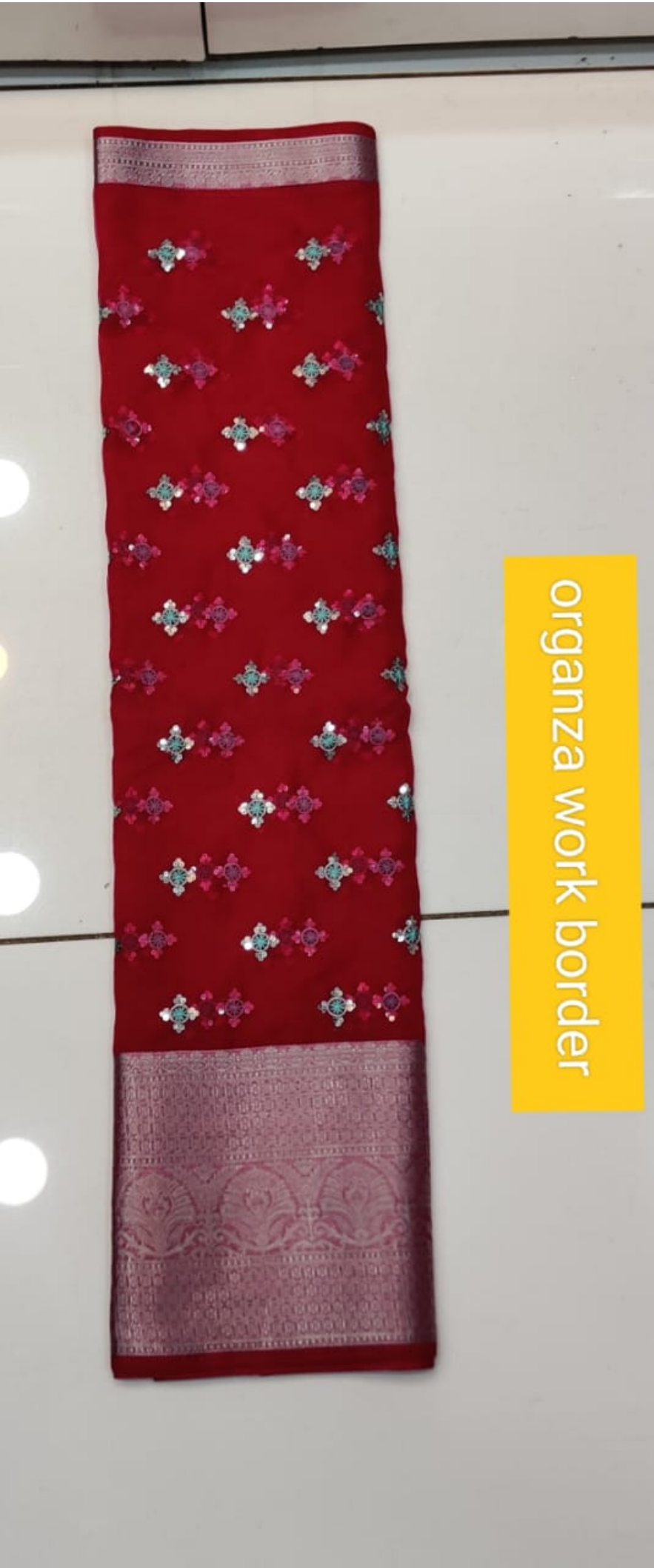
organza work border