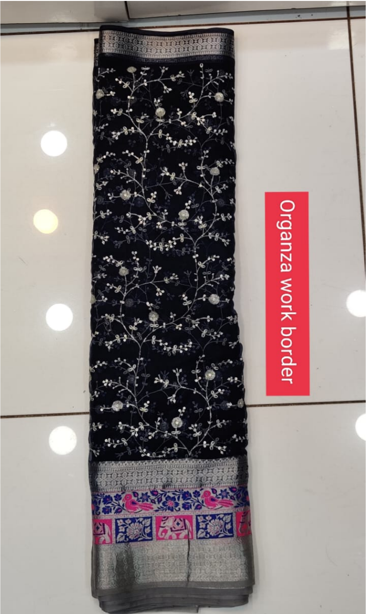
Organza work border