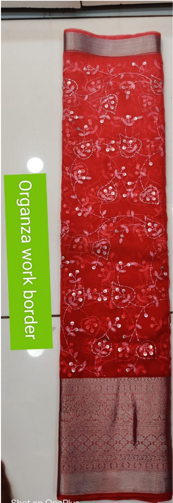
Organza work border